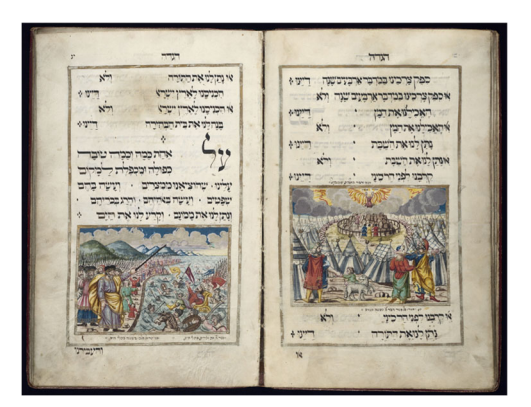
Haggadah shel Pesah, 1726

Jews have been called many things, but one of the very best is "people of the book".